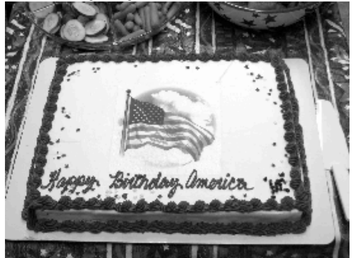
A beautiful cake decorated for the RED/WHITE and BLUE Dance held on July 3 rd .